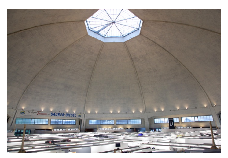
The VOLTA fair takes place in Basel's magnificent domed Markthalle.

Speaking of traveling, it's a big year for the European art circuit, as Basel and VOLTA will coincide with what's being called the "Grand Tour": the 57th Venice Biennale (http://www.labiennale.org/en/Home.html); documenta 14 (http://www.documenta14.de/) in Athens and Kassel, Germany; and the fifth edition of Germany's Skulptur Projekte Munster (https://www.skulptur-projekte.de/).