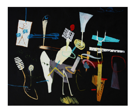
Pontus CARLE Painting